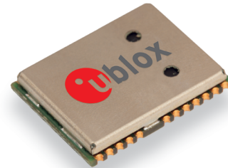
NEO-6V: 12.2 x 16.0 x 2.4 mm