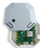
C209 tag reference board