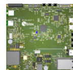
EVB-ANT-1 application board